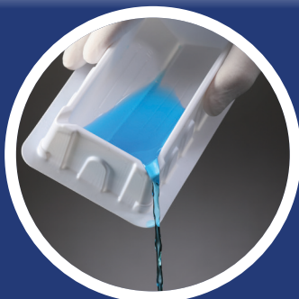
Spouts on all four corners for easy pouring in any hands