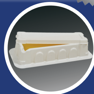
Standard 25mL and 50mL supplied with protective lids