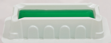
10mL - ER-010