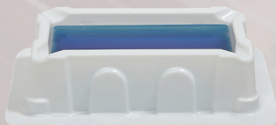
25mL - ER-0258