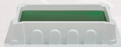
100mL - ER-0100