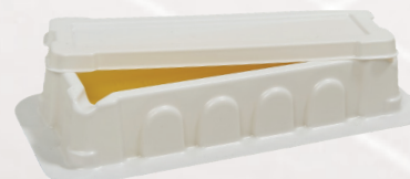
25mL w/ Lid - ER-025