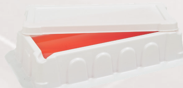
50mL w/ Lid - ER-050