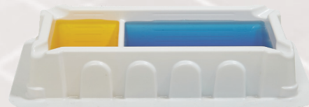
50mL Divided - ER-051